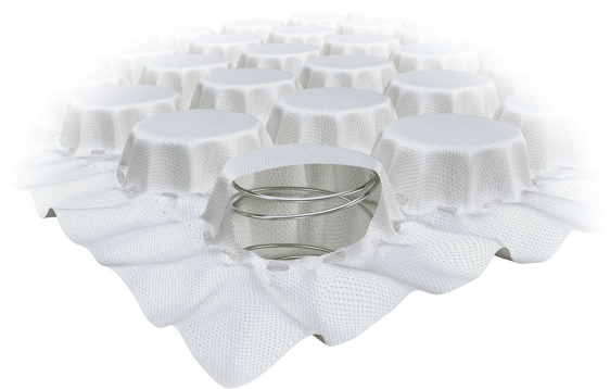
NanoCoil® micro-coil comfort layer