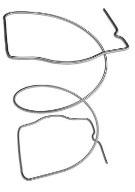
Alternating offset VertiNova® coils