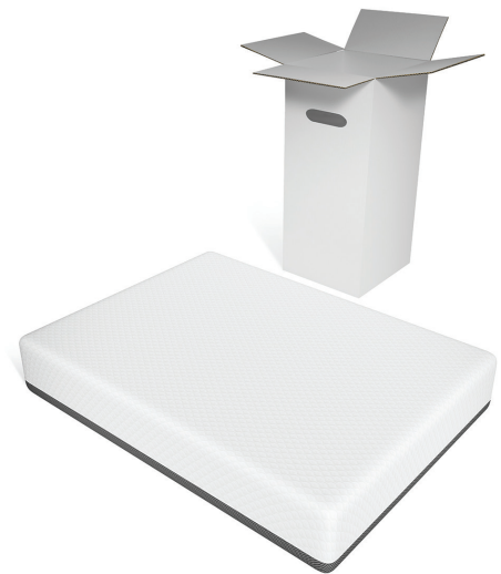
Bed-in-a-Box Compressed Finished Mattresses